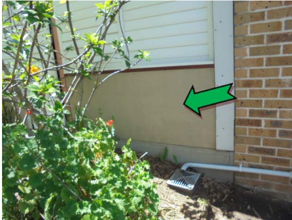
Photo 1. Exterior, rear of building, low level wall panels – non asbestos-containing fibre cement sheeting.