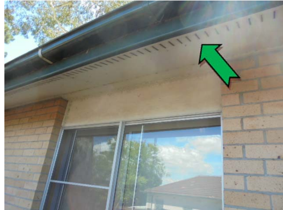
Photo 2. Exterior, throughout, eaves – non asbestos-containing fibre cement sheeting.