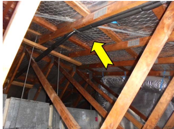
Photo 4. Interior, roof voids, underside of roof – suspected SMF sarking insulation.